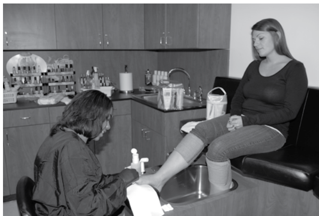
Above: Adult Education Cosmetology Program students practice in one of the lab's newly created pedicure areas.