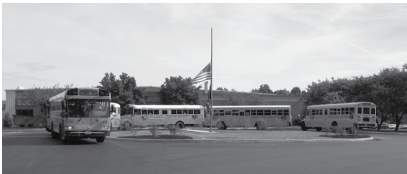
Above: Buses fill the space of the new loop at the Henry Campus.