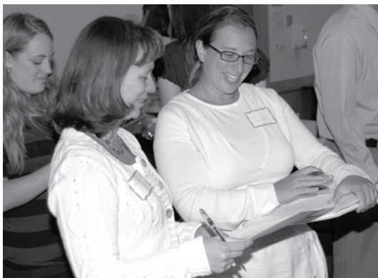
The Teaching American History Grant's third year participants met each other and learned about the project specifications at the grant's initial meeting on September 30 th .