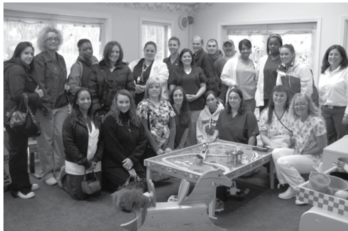
Students from OCM BOCES Adult Education Dental Assisting and Electrical Maintenance classes and BOCES staff recently visited Syracuse's Ronald McDonald House in order to present the organization with a $1,200 donation!

Adult Education students in the Dental Assisting and Electrical Maintenance classes recently raised $1,200 for a donation to the Ronald McDonald House Charities of Central New York. The Ronald McDonald House in Syracuse is currently undergoing a major renovation in order to make it