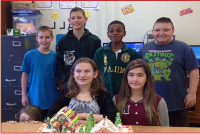
Pictured above: Cedar Street students' gingerbread house creation