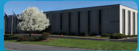
(110 Elwood Davis Road, Town of Salina)

Currently, OCM BOCES owns two facilities and leases eight more. A building purchase reallocates some of the current rental budget and allows those funds to be used to buy this building.