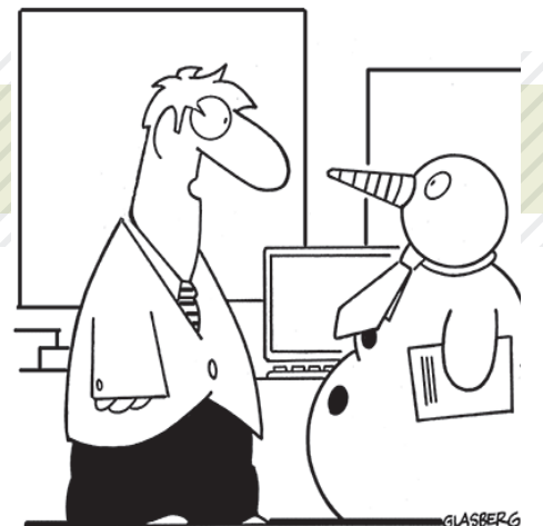
"The rest of us would appreciate it if you would leave the thermostat alone."